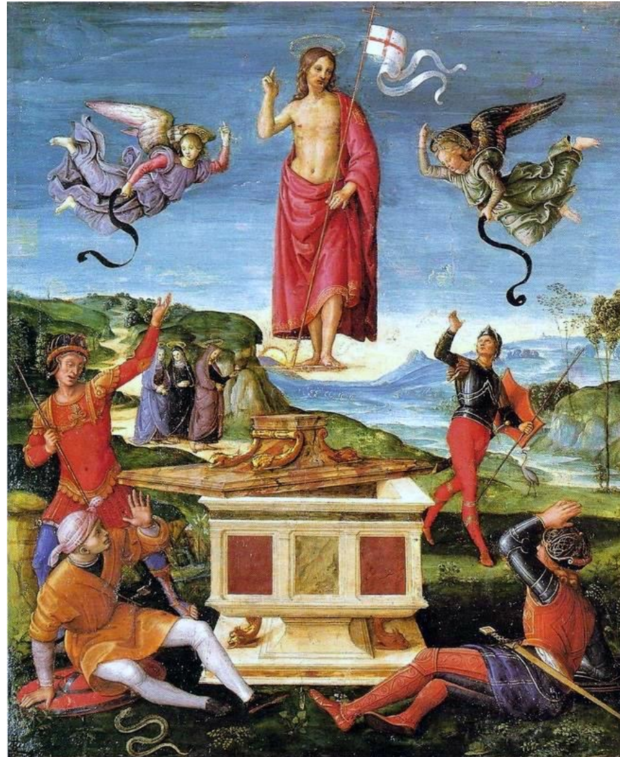
Raphael, Resurrection of Christ