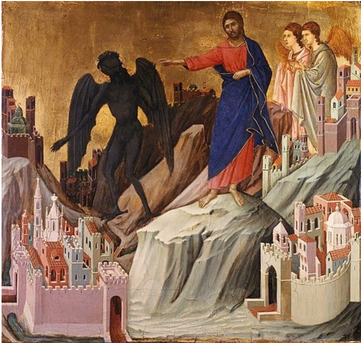
Duccio di Buoninsegna, "The Temptation of Christ on the Mountain."

9... and he said to him, "All these I will give you, if you will fall down and worship me."